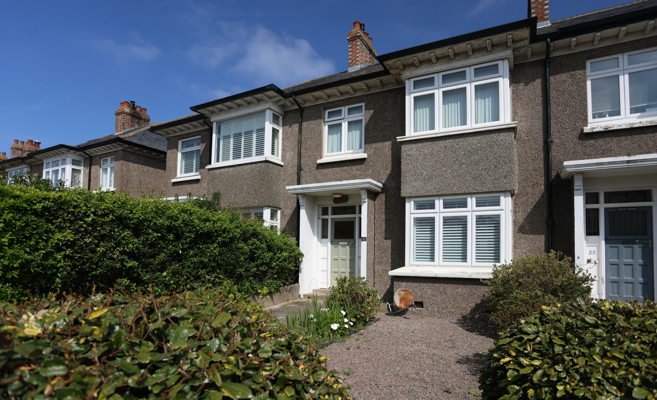
Madeira 21 Southlands, Green Road, St Clement, Jersey, JE2 6QA £650,000